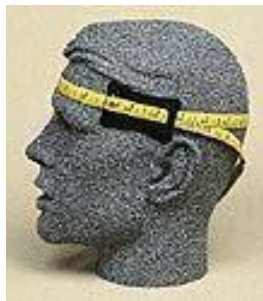
Head Circumference Measurement

To determine the correct shell size allocation for the user follow the procedure listed below. Using a tape measure, obtain a head circumference measurement from the helmet user (as per the graphic shown below).